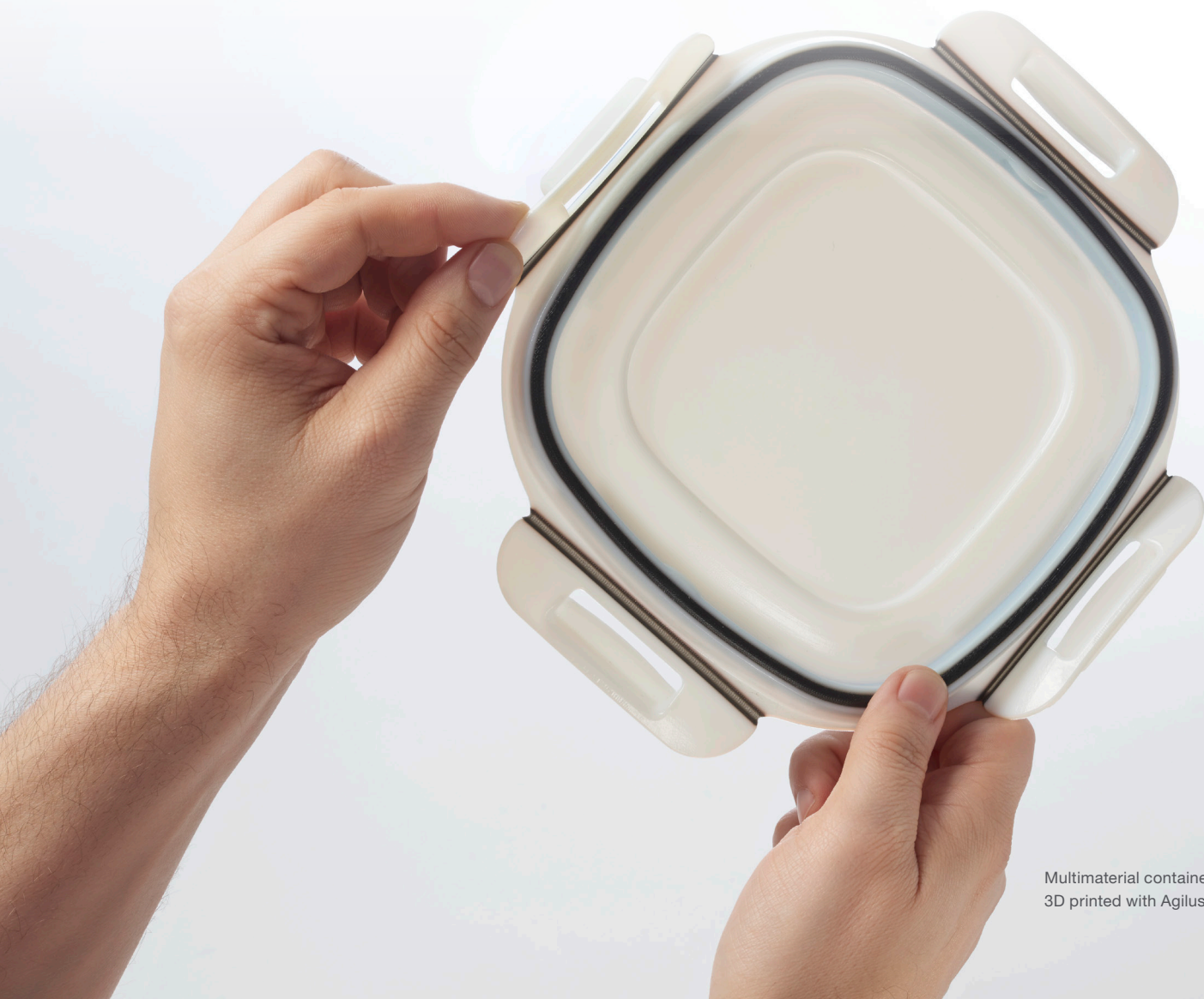
Multimaterial container lid prototype 3D printed with Agilus30 material

And if you need full-color capabilities down the line, the J850 Pro can be upgraded to meet those needs.